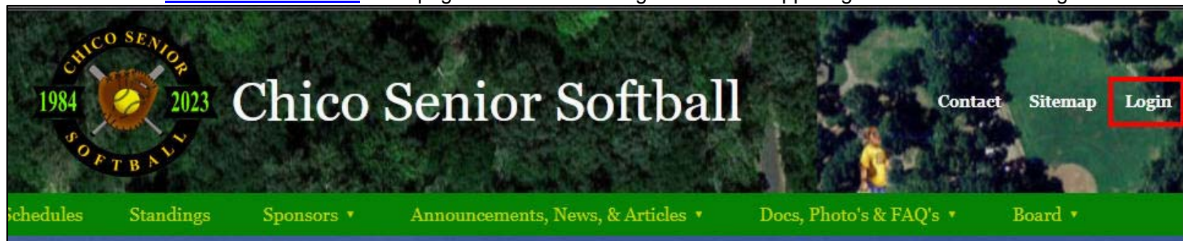
Figure 1: CSS Homepage